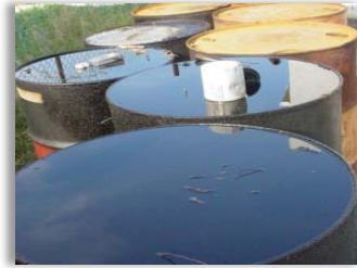
Combustible material stored around the dwelling. KC Solid Waste Code Violation § 8.28.110