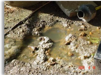
Surfacing sewage. KC Housing Code Violation § 1001.2