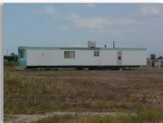
Mobile home(s) being stored. KC Zoning Code Violation § 19.02.060

A Partnership to Promote Health and Safety and Maintain Community Standards