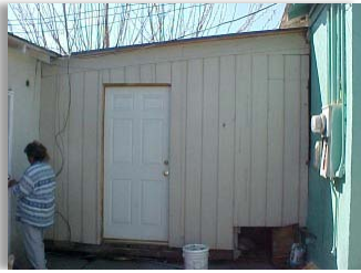
Construction without building permits. KC Building Code Violation §17.08.03