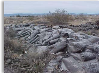
Illegal dumping. KC Solid Waste Code Violation § 8.28.080