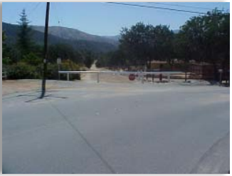
Blocking public access. KC Zoning Code Violation § 19.02.060