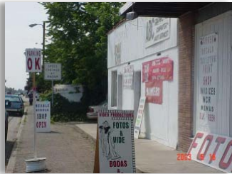
Illegal signs. KC Zoning Code Violation § 19.02.060