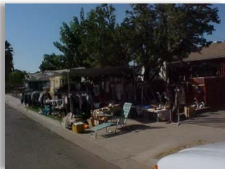
Continuous yard sale. KC Zoning Code Violation § 19.02.060